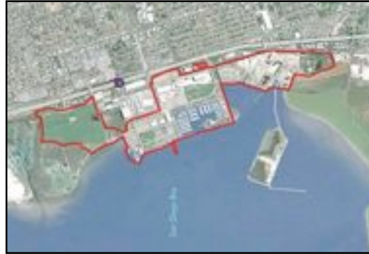
The Chula Vista Bayfront Master Plan represents what good can come when economic development and environmental protection are balanced for the benefit of all.

Members are representatives from the Environmental Health Coalition, San Diego Audubon Society, San Diego Coastkeeper, Coastal Environmental Rights Foundation, Southwest Wetlands Interpretive Association, The Surfrider Foundation and Empower San Diego.