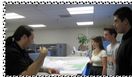
EMPOWERStudents! Interns from High Tech High get a lesson from the Registrar of Voters about voting

program development, and local politics.